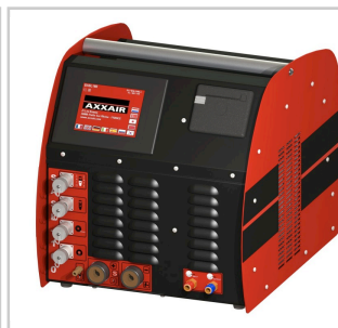
Driven by AXXAIR power source ( cf compatibility table )