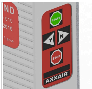
Remote control keypad