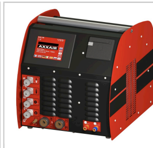
Driven by AXXAIR power source ( cf compatibility table )