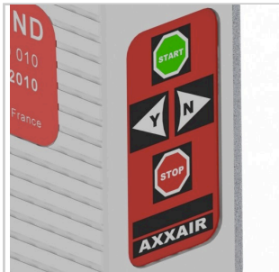
Remote control keypad